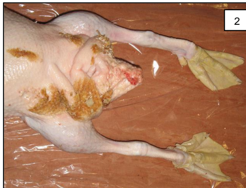
Figure 2: Typical dermatitis in a duck.