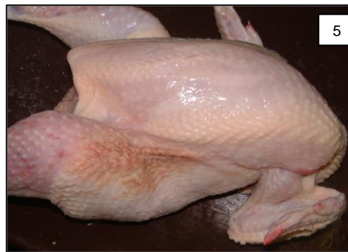
Figures 4 & 5: Dermatitis probably caused by Staphylococcus infection