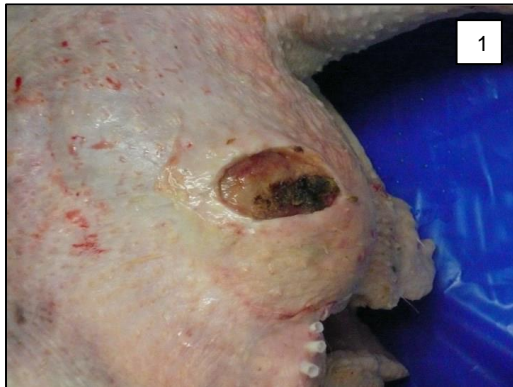
Figure 1: Gangrenous dermatitis in a broiler.